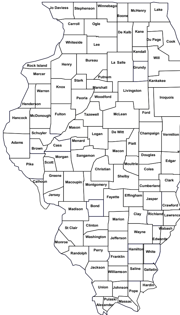
Table 25: Enrollment of Illinois Residents by County Fall 2014